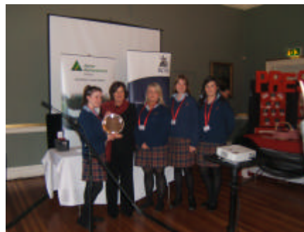
Presentation at the RDS