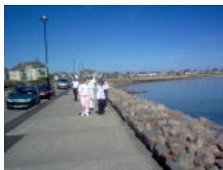
Hard at work but enjoying the sunshine!!!